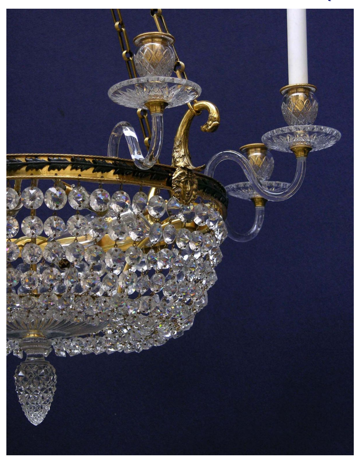
Regency eight branch gilt and cut glass Chandelier with masks