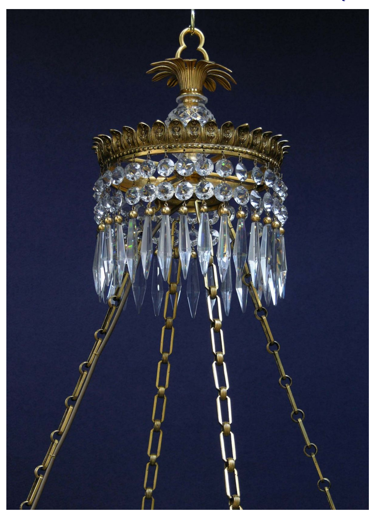
Regency eight branch gilt and cut glass Chandelier with masks