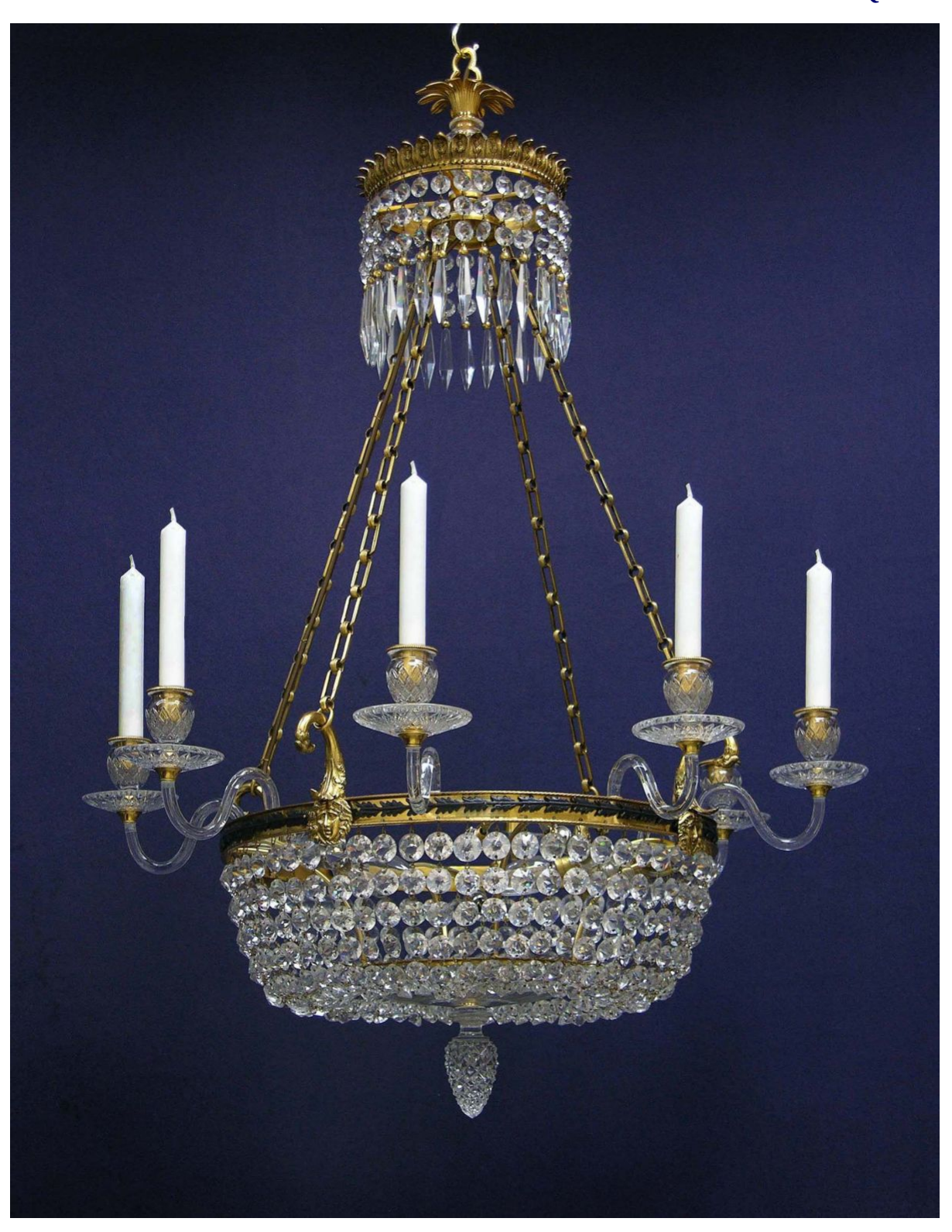
Regency eight branch gilt and cut glass Chandelier with masks: the black leaf-decorated gilt ring with ladies' facemasks and glass candle-arms, cups and pans, suspended on four chains from top glass-fringed corona to eagle-head hooks; dressed with cut glass prisms and gilt-capped icicle pendants. Regency and restored.

Height: 42" - 107.0cm Width: 30" - 76.0cm