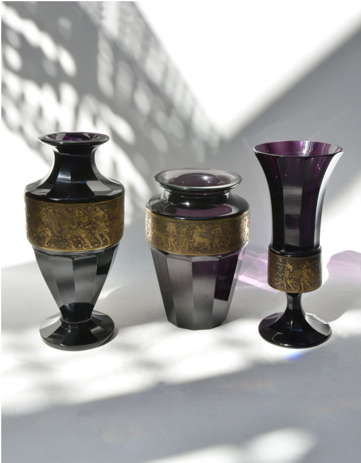
Amethyst glass Moser 'Amphora' Vase with gilded warrior frieze