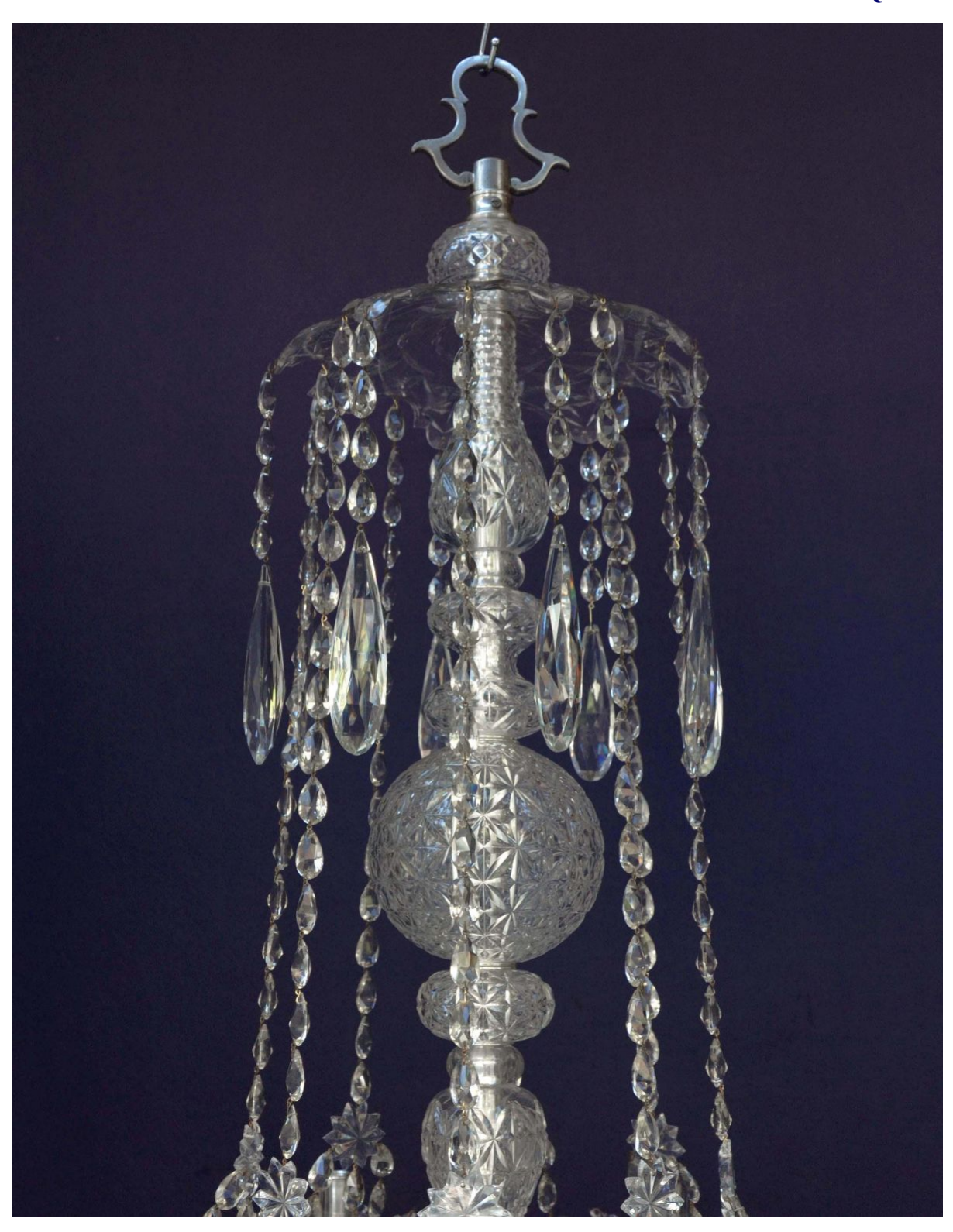
Eight branch 18th Century Irish style cut-glass Chandelier by Osler