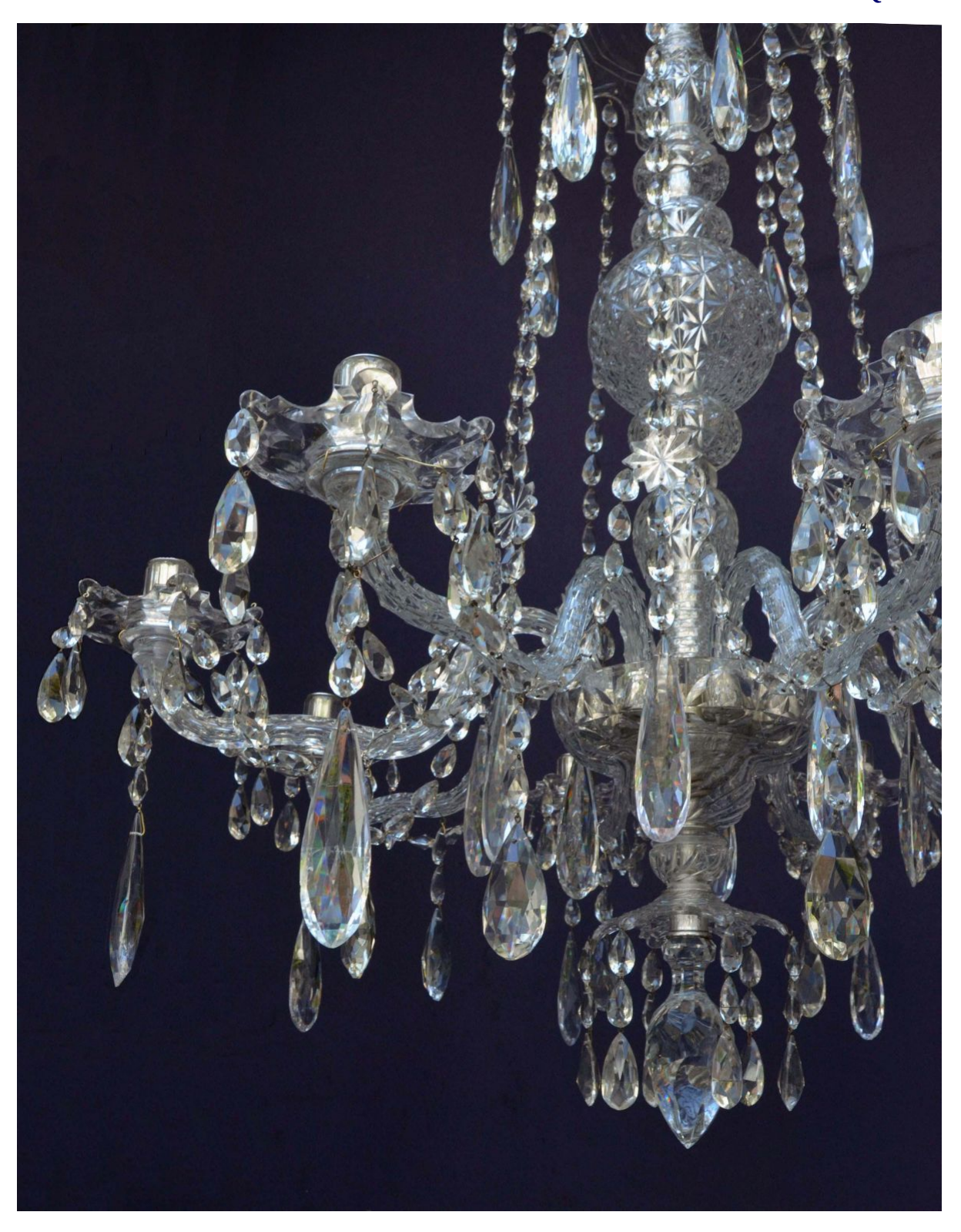
Eight branch 18th Century Irish style cut-glass Chandelier by Osler