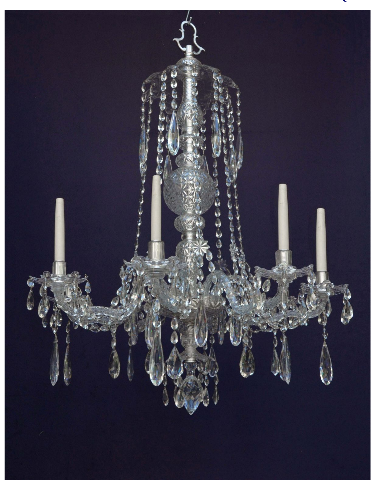
Eight branch 18th Century Irish style cut-glass Chandelier by Osler: of elegant proportions with top canopy dish, centre sphere and shaped body bowl above pointed finial; cut with a shallow diamond and cross design; dressed with racemes of pear-shaped prisms and long pear-shaped pendants. Circa 1910 and restored.