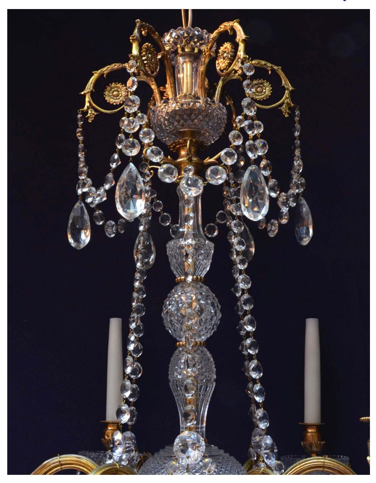
Six branch cut glass and gilded Chandelier by Osler & Company