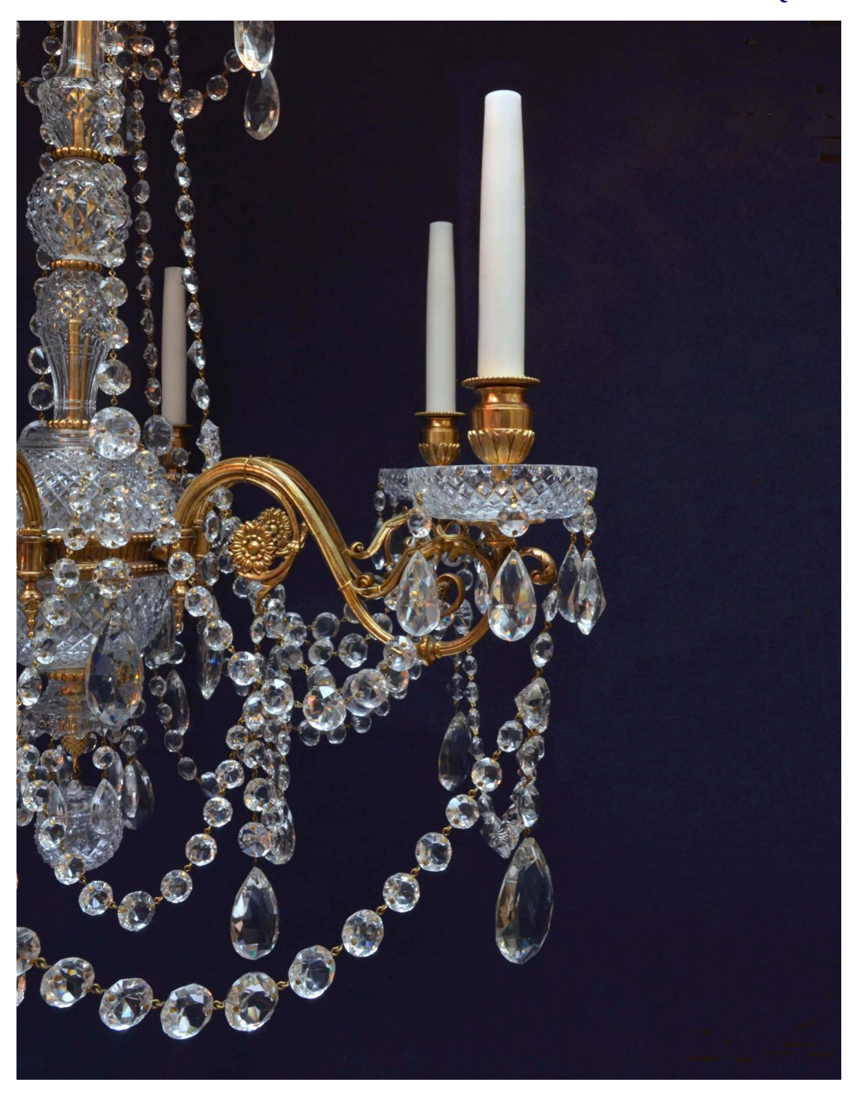
Six branch cut glass and gilded Chandelier by Osler & Company