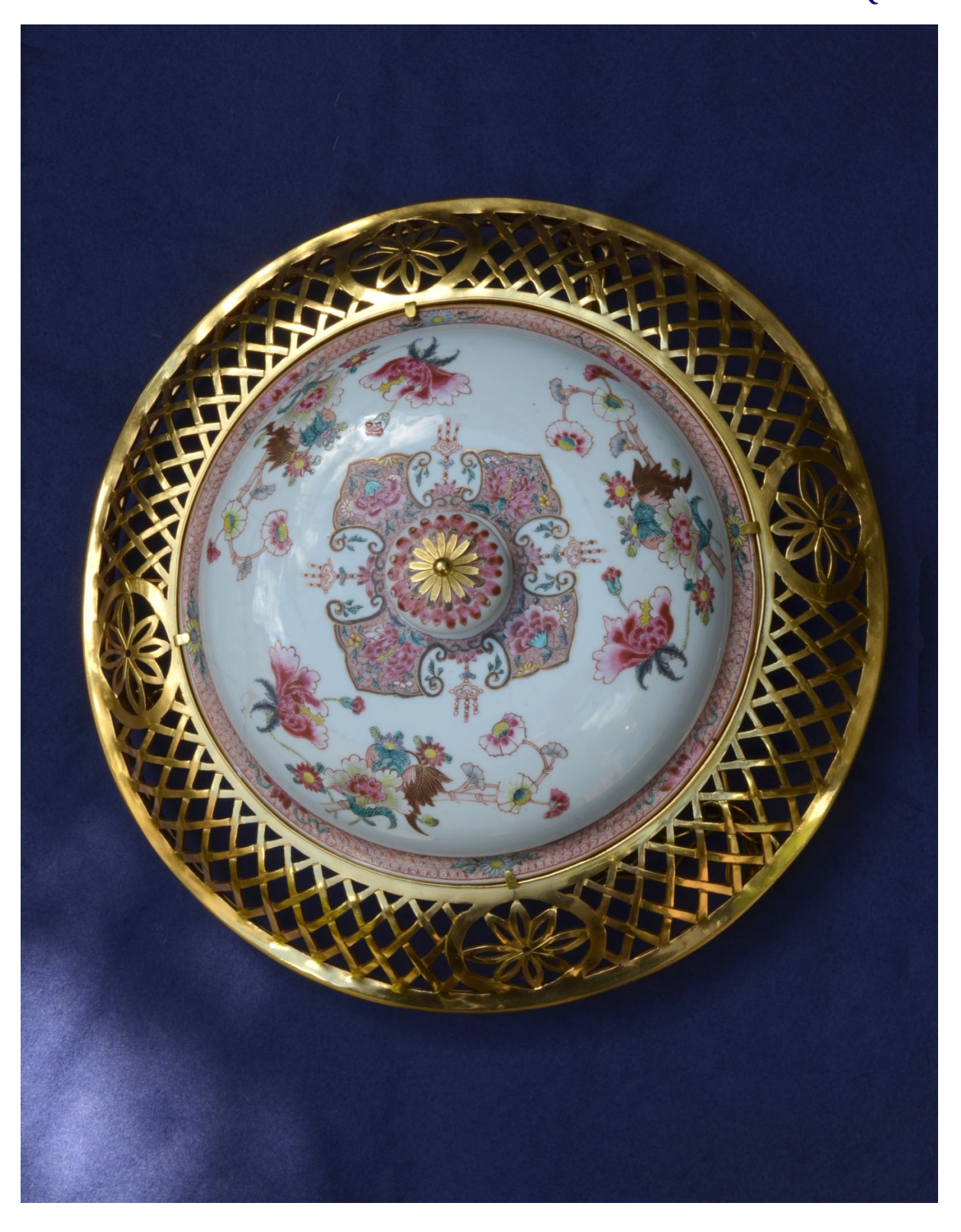
Near pair of gilt-lattice mounted and Chinese Porcelain Dish Lights