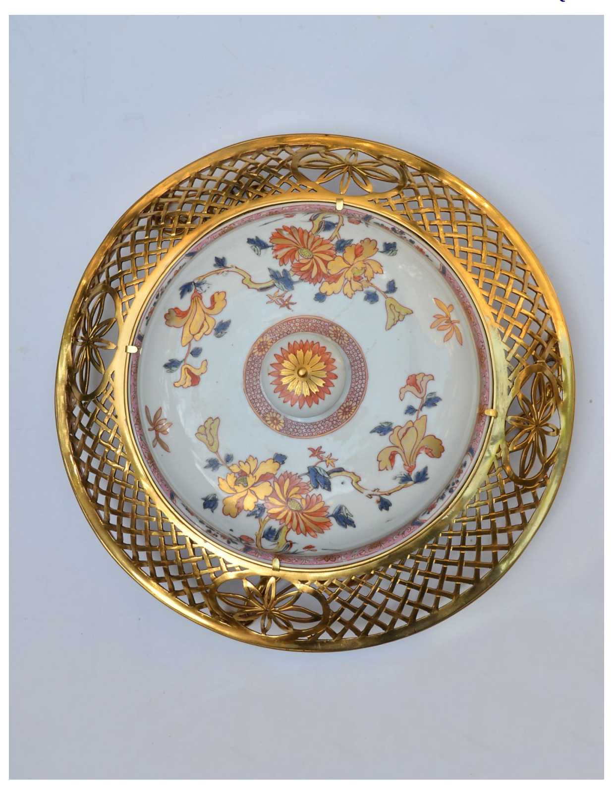
Near pair of gilt-lattice mounted and Chinese Porcelain Dish Lights