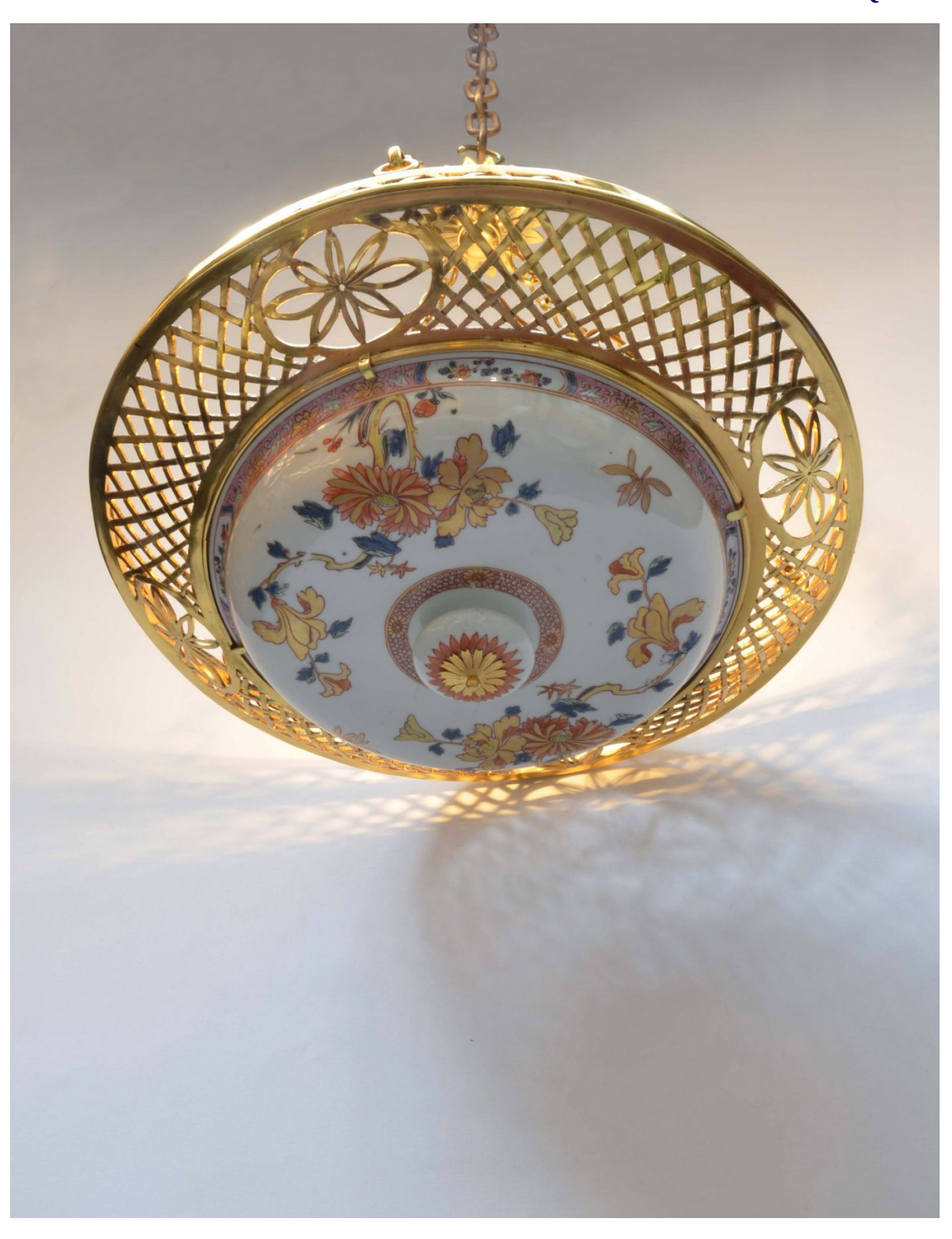
Near pair of gilt-lattice mounted and Chinese Porcelain Dish Lights