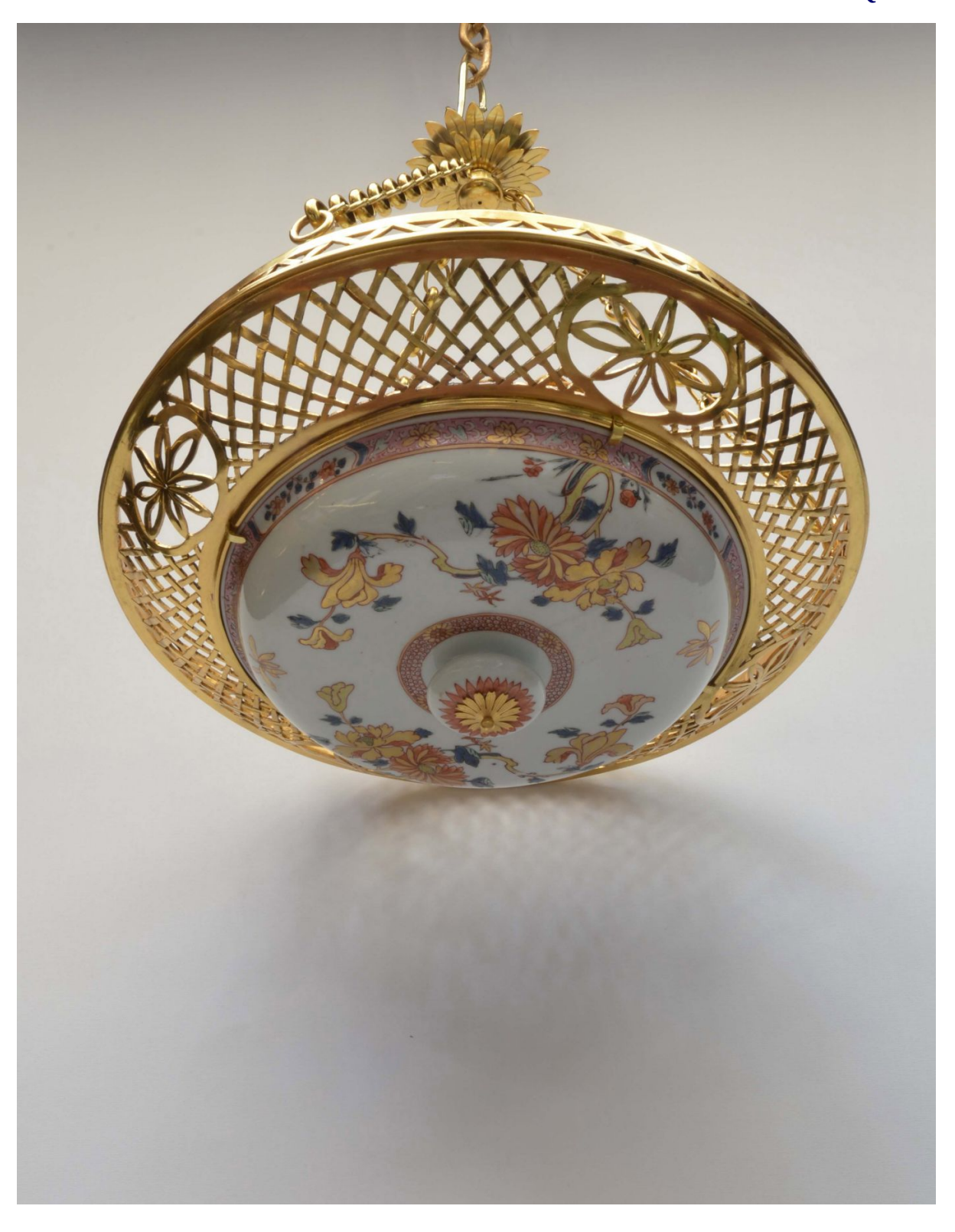
Near pair of gilt-lattice mounted and Chinese Porcelain Dish Lights