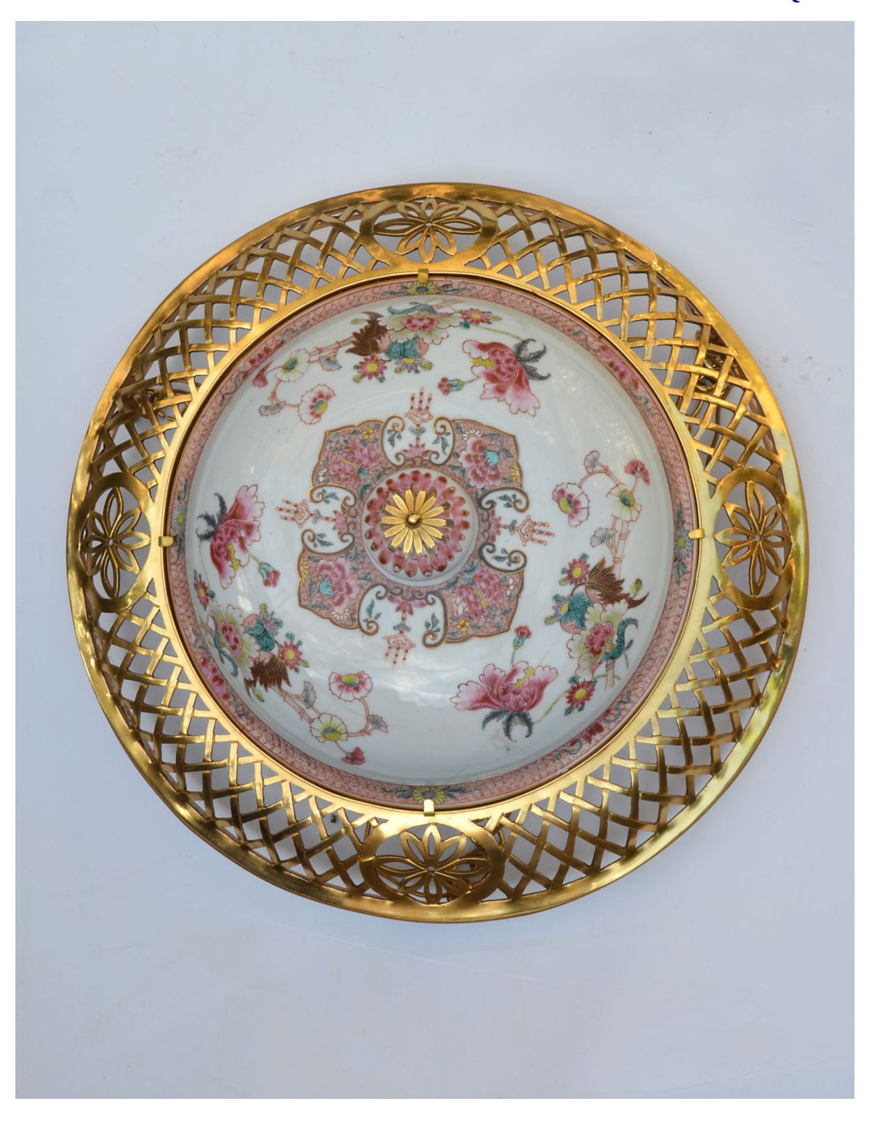
Near pair of gilt-lattice mounted and Chinese Porcelain Dish Lights