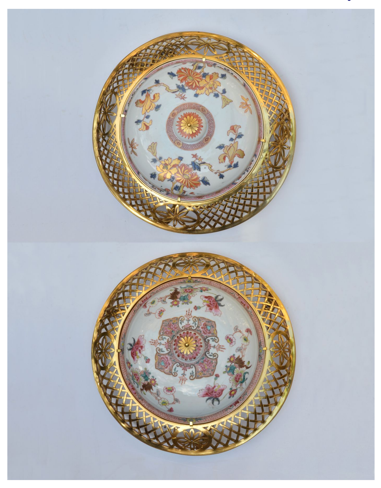
Near pair of gilt-lattice mounted and Chinese Porcelain Dish Lights