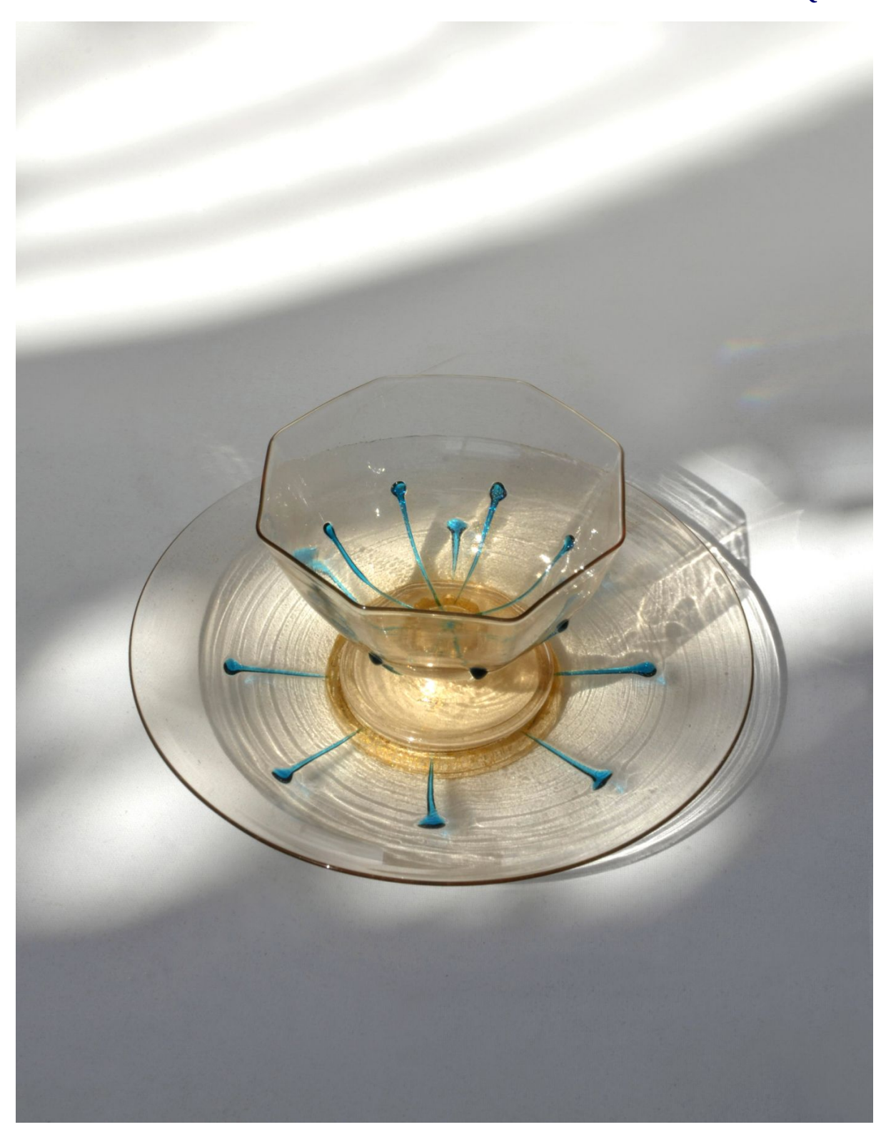
Late 19th Century Murano glass Bowl and stand by Salviati & Cie