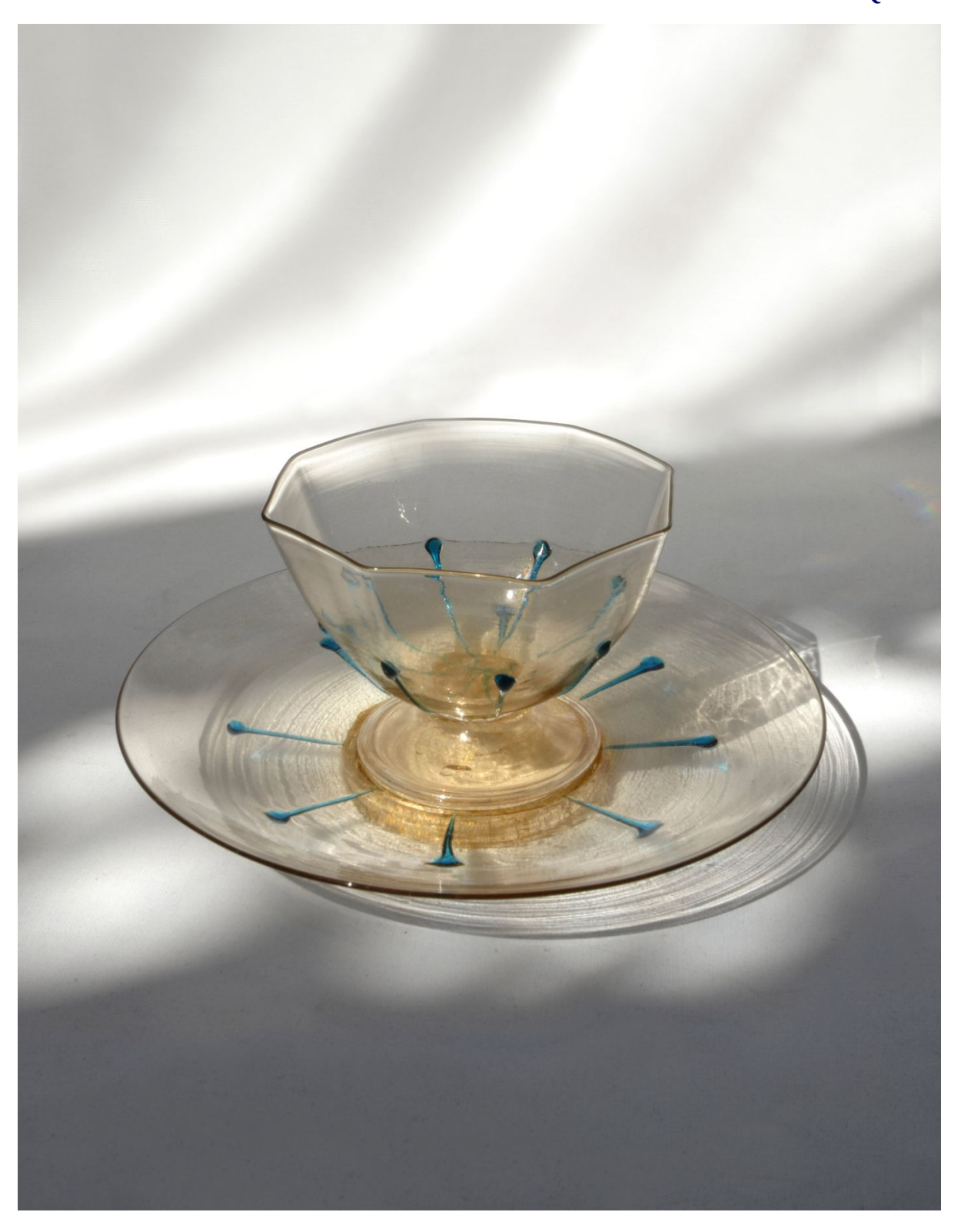
Late 19th Century Murano glass Bowl and stand by Salviati & Cie: the footed octagonal bowl decorated with fine turquoise tear drops over gold aventurine ground with matching stand. Circa 1890.