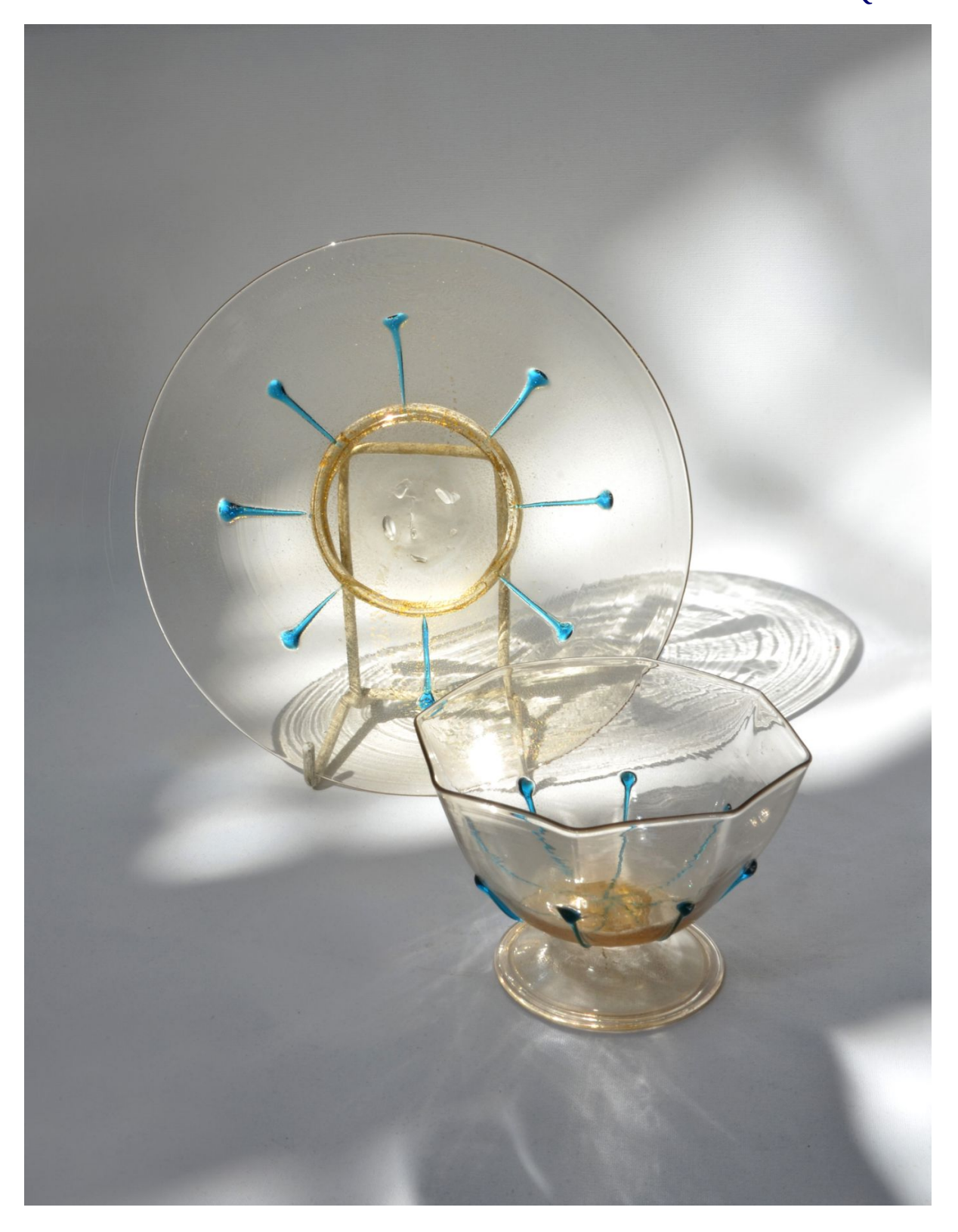
Late 19th Century Murano glass Bowl and stand by Salviati & Cie